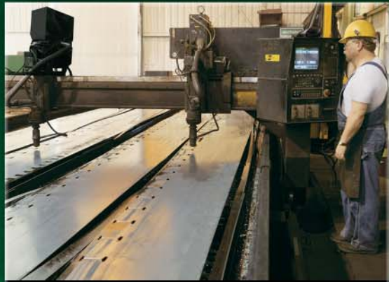
Computer controlled cutting assures the dimensional integrity of the Fontaine XtremeBeam®.

IT ALL BEGINS WITH HIGH QUALITY STEEL THAT IS CUT TO PERFECTION USING COMPUTER CONTROLLED PROCESSES. THE RUGGED ONE-PIECE MAIN BEAM WEB DESIGN FEATURES A GENEROUS CAMBER TO PROVIDE ADDED STRENGTH UNDER LOAD. 3/8" STEEL TOP AND BOTTOM FLANGES ARE WELDED ON BOTH SIDES OF THE BEAM USING ROBOTICS TECHNOLOGY. THIS TAKES THE GUESSWORK OUT OF THE PROCESS TO GIVE OUR CUSTOMERS CONSISTENT QUALITY AND SUPERIOR WELD INTEGRITY. ADDITIONAL STEEL