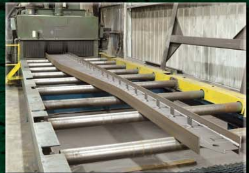
Paint adhesion is dramatically improved by an automated cleaning process.

THE BEST QUALITY, THE HIGHEST RESALE VALUE AND THE MOST RELIABLE PERFORMANCE IN THE INDUSTRY—ALL BACKED BY THE BEST WARRANTY IN THE BUSINESS.