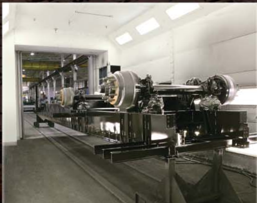
Electrostatically applied plural component urethane top coat provides superior resistance to corrosion.