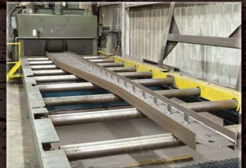
Paint adhesion is dramatically improved by an automated cleaning process.