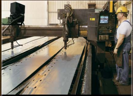
Computer controlled cutting assures the dimensional integrity of the Fontaine XtremeBeam®.

IT ALL BEGINS WITH HIGH QUALITY STEEL THAT IS CUT TO PERFECTION USING COMPUTER CONTROLLED PROCESSES. THE RUGGED ONE-PIECE FRONT AND REAR MAIN BEAM WEB DESIGN FEATURES A GENEROUS CAMBER TO PROVIDE ADDED STRENGTH UNDER LOAD. STEEL TOP AND BOTTOM FLANGES ARE WELDED ON BOTH SIDES OF THE BEAM USING